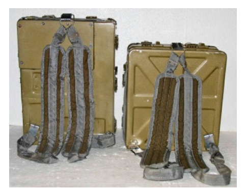
Rear view of power unit (left) and R-393, showing carrying arrangements.

Spare parts box opened. When not in use, the hand crank was stored in here.