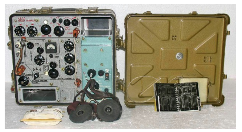
Front panel view of R-393, believed the B version without high speed Morse keyer.